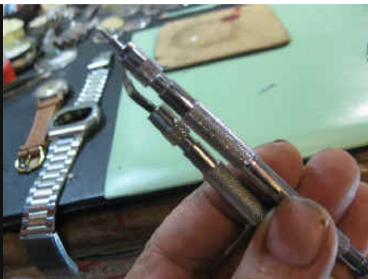
STEEL SPRING BAR TOOLS GET THE BEST HIGHEST PRICED PERIOD YOU KNOW THE DIFFERENCE BY WEIGHT