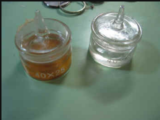
THESE BABIES ARE CHEAP FROM CHINA ON THE BAY THEY DO NOT EVAPORATE RIGHT IS STINKY BENZENE HAIR SPRING AND BALANCE CLEANER LEFT IS KROL