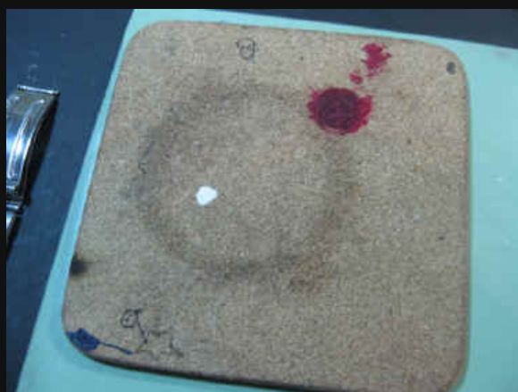
CORK CASTERS GREAT FOR DRYING BALANCES & PARTS WHEN DIP CLEANED ALSO FOR WORKING ON MOVEMENTS ;