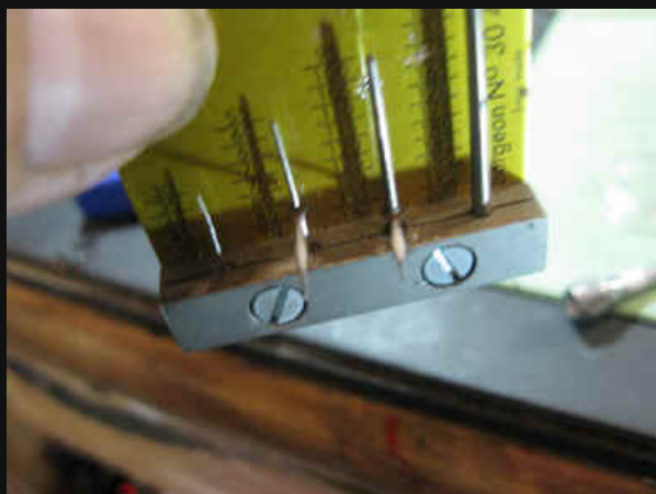
HAND SIZING TOOL DOUBLES AS HAND HOLDER