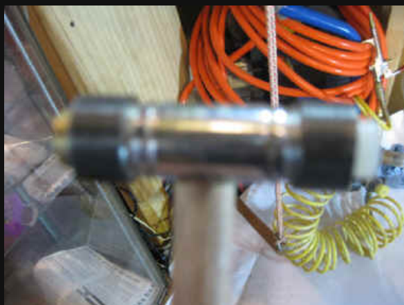
MY HAMMER A WATCH HAMMER BRASS AND NYLON A MILLION REASONS