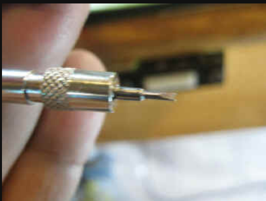
SMALL V GREAT FOR HARD TO EACH BARS