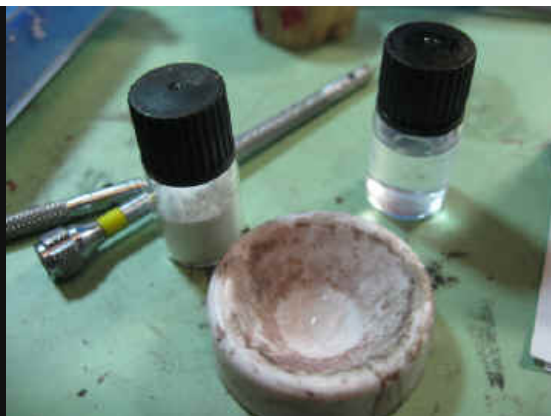
LUMINOVA I PREFER WHITE BUT COMES IN 6 COLORS MIX 50/50