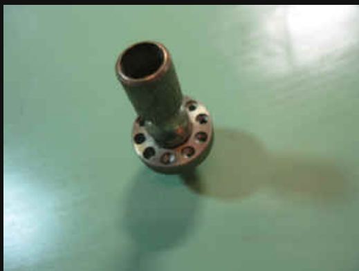
I HAVE 11 OF THESE GREAT FOR PAINTING LUMING HANDS SMALLER ONES ARE USE WITH BROACHES TO ENLARGE HOLES IN HANDS THIS ONE WAS FOR POCKET WATCH HANDS IT IS SPRING LOADED AND HAS "NUT LOCK SYSTEM"