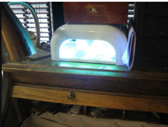
85 BUCKS THERE IS A 50.00 UNIT BUT THE LARGE ONE ALSO DRIES HANDS DIALS PAINT