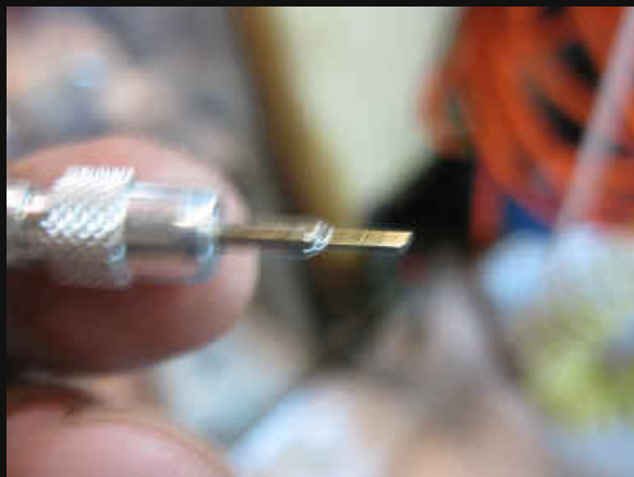
BLURRY, BUT THIS END PIECE IS ROUND USED EXCLUSIVELY FOR GO-THROUGH LUGS