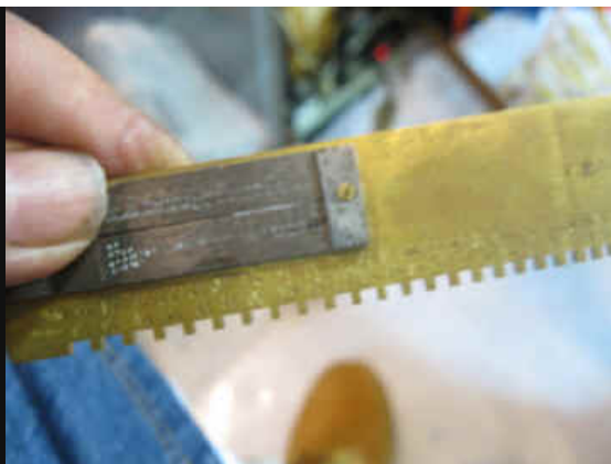
OF COURSE A MAIN SPRING GAUGE WOULD BE GREAT