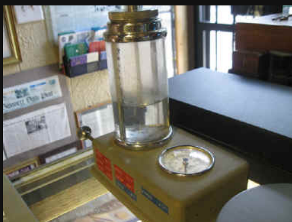
AN OLD 1962 BERGEON PRESSURE TESTER PUMP THE DEPTH SMALL