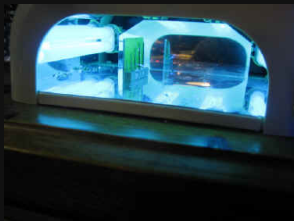
AS U SEE