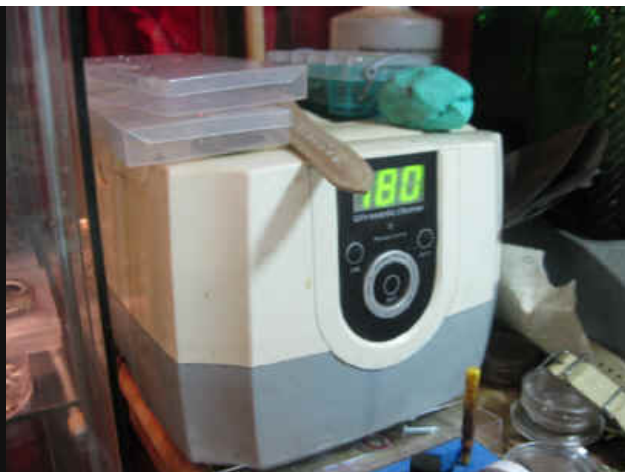
5 SPEED ULTRASONIC ULTRASONIC WATCH CLEANING SOLUTION