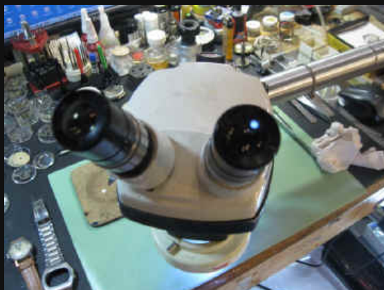
MY B ABY