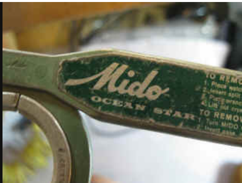
HERE IS A MIDO OCEAN STAR WRENCH