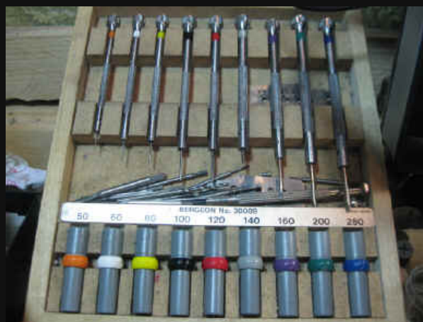
A GREAT SCREW DRIVER KIT IS IMPORTANT NOTE IF YOU CANNOT USE A SHARPENER THE TIPS ARE AROUND 1.20 THAT ADDS UP CAUSE GOOD ONES ARE EXTREMELY BRITTLE THE MORE THE BETTER