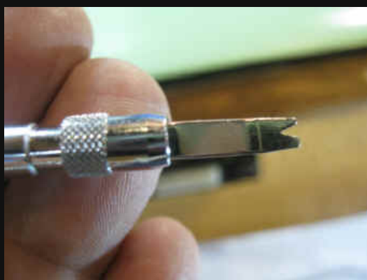
WIDE V EASY TO REMOVE LEATHER CLOTH ETC STRAPS