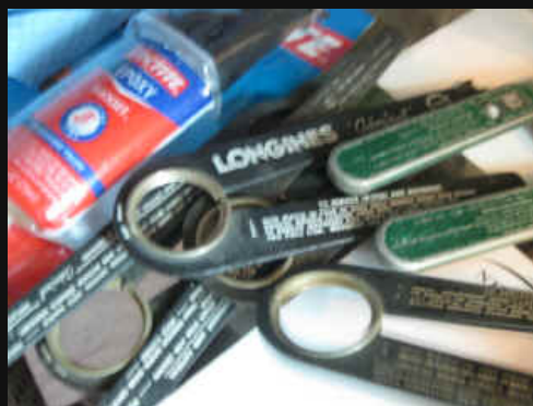
VINTAGE DIVE WATER PROOF CRYSTAL REMOVERS