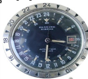
Black Dial Automatique

Major model changes can be as simple as changing a word. The white dial, red date Airman with automatic spelled in French as 'Automatique' on dial center above the "12" --a French influence possibly due to the Indochina War- and it's tail-ended Minute hand finally evolved after 1960 with 'Automatique' altered to the English word 'Automatic' and its long tail minute changed to a long tail hour hand [ready for USA and Vietnam?]