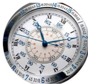
HOURS ANGLE WATCH MODERN VERSION

THE SECOND PILOT DESIGNED WATCH FOR THE PILOT DESIGNED BY THE AVIATOR LINDBERGH A PUPIL OF WEEMS PRODUCED BY LONGINES THUS LAYING ADDITIONAL GROUND WORKS FOR THE AIRMAN PATENT REGISTERED 1935.