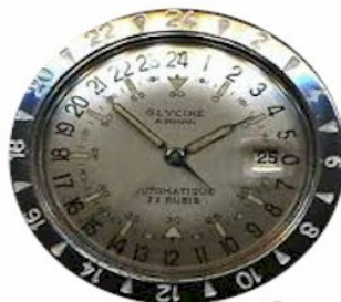
White Dial Automatique