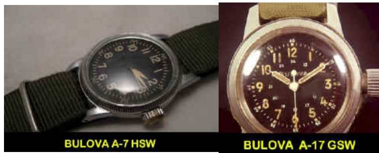
BULOVA A-7 HSW A-11 NO ILLUMINATION