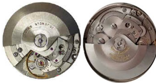
AS 1701 AS 1903

This mechanism was only utilized in the Glycine late '50's and '60s in Airman and Combat lines. This means that spare wires and/or parts are limited at best. Additionally, the Felsa. Schild, ETA models have different cases with different case rings.