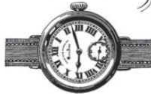
The "QUEEN ANNE" Pocket Model 3 Jewels Nickel Silver Rs. 21