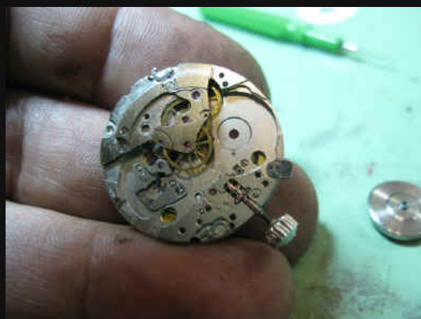
YOU WILL WANT TO LUBE JEWELS AND WEAR POINTS FOLLOW THE SPECIFIC ETA MANUAL OR ANY ETA AUTOMATIC OIL POINT SHEET