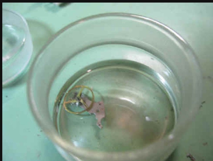
SOAK A FEW MINUTES THEN MOVE AROUND AND LIFT OUT