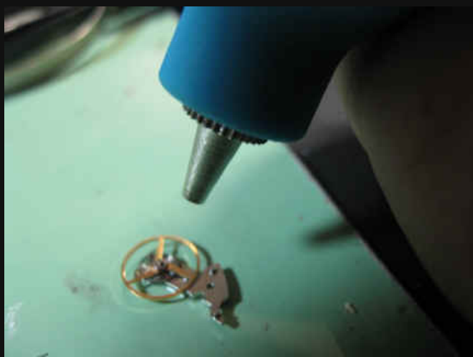
DRY GENTLY WITH BLOWER BE SURE TO OIL TOP BALANCE JEWEL IT IS NOW DRY....