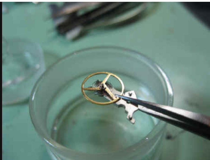
PLACE BALANCE INTO CLEANER