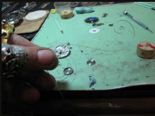
AUTOMATICS HAVE BRIDAL SPRINGS THIS ONE WILL BE INSTALLED BY HAND