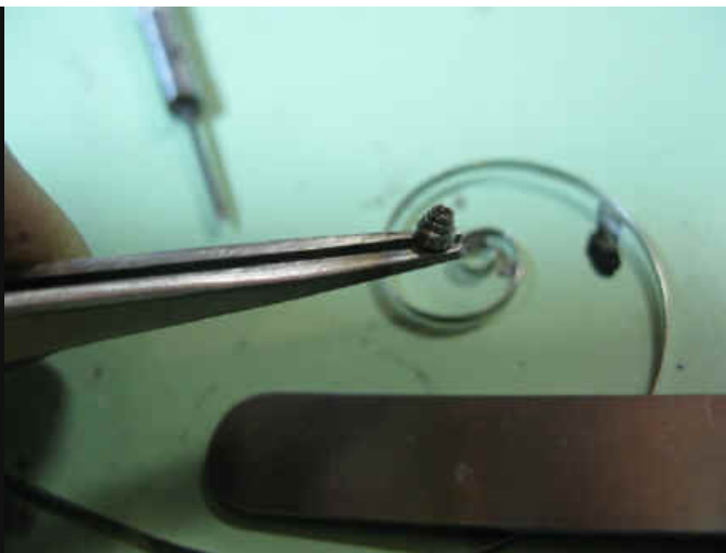
ARBOR REMOVED NOTE THE SMALL CATCH FOR SPRING