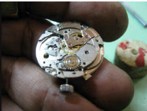
READY TO PULL MAINSPRING BRIDGE