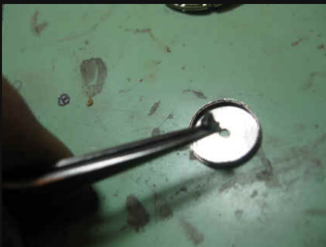
THE BARREL IS FINE. DAMAGE WILL NOT EFFECT CLOSING OR OPERATION