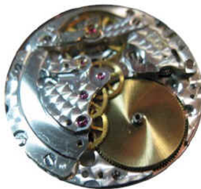
LIFT OUT MAIN SPRING BARREL