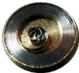
BARREL WITH NEW SPRING