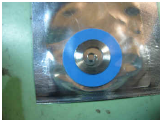
ROLEX MAIN SPRING FOR 3135