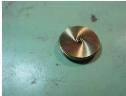
MAIN SPRING BARREL