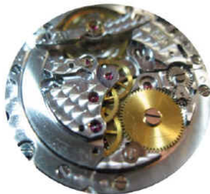
BACK TOGETHER AFTER FULL TEAR DOWN CLEAN & LUBE