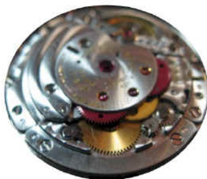
WE DISCOVERED A PROBLEM WITH ROTOR ASSEMBLY