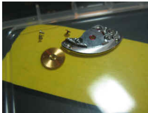
BRIDGE AND RACHET WHEEL