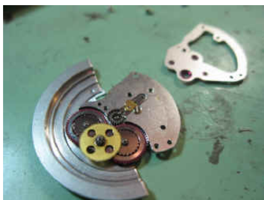
WE TEAR IT DOWN