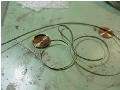
ARBOR REMOVED SPRING REMOVED