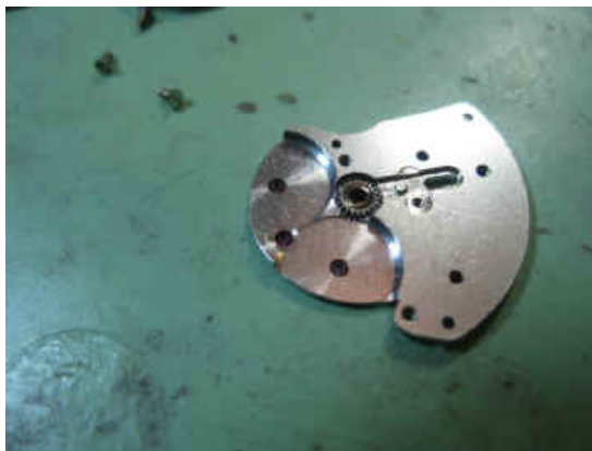
CENTER WHEEL IS WORN LOCK IS WORN