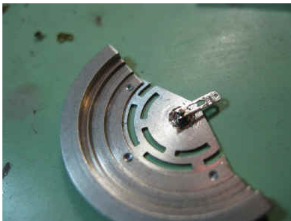
HERE WE ARE TESTING