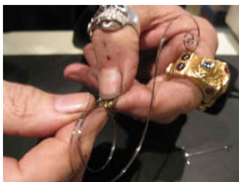
HAND INSTALLING MAIN