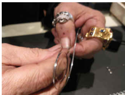
HAND INSTALLING MAIN