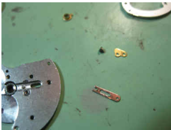
WE REMOVE & REPLACE LOCK WITH USED PIECE ALSO CENTER WINDING WHEEL