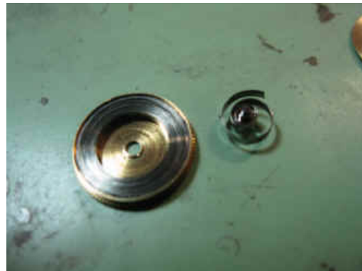
OPENED NOTE THE SPRING IS BROKEN ARBOR STILL ATTACHED TO BROKEN PORTION