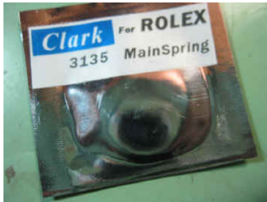
ROLEX MAIN SPRING FOR 3135 31 JEWEL AUTOMATIC

ROLEX REPAIR 3135 31 JEWEL 5 ADJ AUTOMATIC MOVEMENT