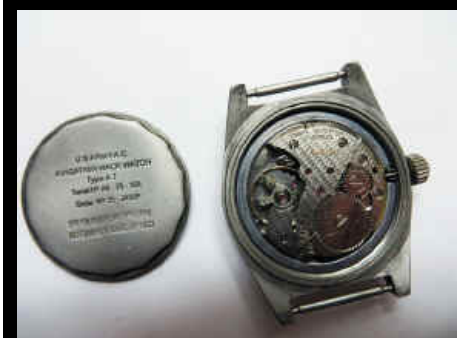
ABOVE IS AN ALLEGED US ARMY WATCH WITH SAME MOVEMENT AS THE ALLEGED IOMEGA ABOVE