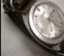
1968 SEIKO 6119 7170