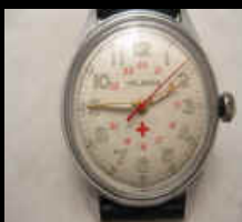
1960-1970 WYLER INCAFLEX & DYNAWIND