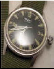
1968 SEIKO 6106 8100