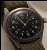
1968 Belforte & Benrus plastic 3818A 1968-benrus-mil-w-3818b