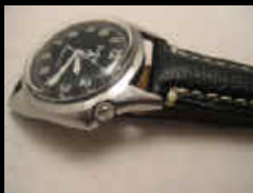
1965-1971 BULOVA/CARAVELLE 333/666 DIVE