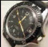
1965 WALTHAM 24HR