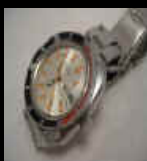
1955-1969 HELBROS SWEEPS