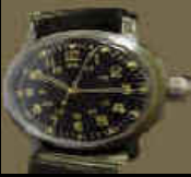
1972 Metal Hamilton.