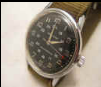
1969 WESTEND 24HR