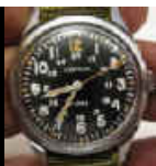
SEIKO 1970 6105 DIVE