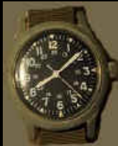
1965 Benrus "hack" DTU-2A/P