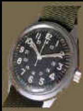
1967 BENRUS METAL SINGLE CASE MIL-W-3818 – 2A/P MIL-W-3818B