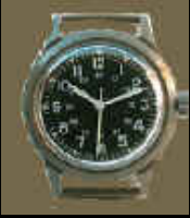
1970 Jeambrun/Seiko plastic plastic Westclox