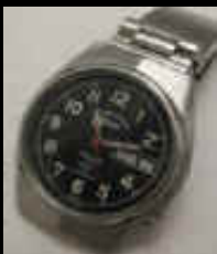
1965- DOXA 300T