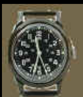
1969 Belforte & Benrus plastic ,