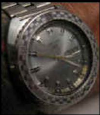
1965-1970 WALTHAM DIVE