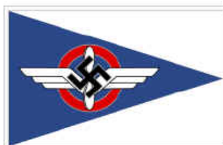
Flag of the Deutscher Luftsportverband (DLV) , German Airsports Association.

The origins of the Luftwaffe were born just months after A H came to power. Hermann Goring, a World War I ace with 22 victories and the holder of the Orden Pour le Merite, became National Commissar for aviation with former Lufthansa employee Erhard Milch as his deputy. In April 1933 the Reichsluftfahrtministerium (RLM – Reich Air Ministry) was established. The RLM was in charge of development and production of aircraft. Hermann Goring. Goring was commander-in-chief of the Luftwaffe until April 1945.