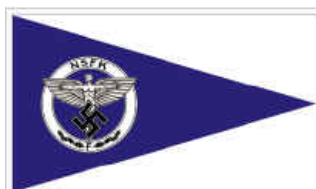
The NSFK pennant. Members helped form the nucleus of the Luftwaffe in 1933